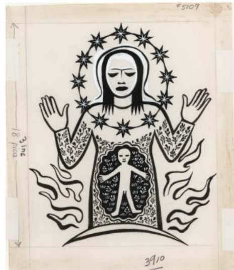
St. Catherine University, Ade Bethune Collection

This exhibit features collections from three member institutions: the Ade Bethune Drawings at St. Catherine University, Religious Artifacts at Seton Hall University, and the Santo Collection at Regis University. These collections were selected because they represent many different facets of liturgical art. The exhibit was assembled in honor of the CRRA's upcoming Symposium and Annual Meeting, "Bringing the created toward the Creator: Liturgical art and design since Vatican II," which will take place on June 1-2 at Catholic Theological Union.