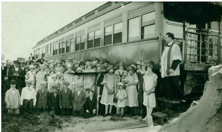
St. Anthony Feb. 1926