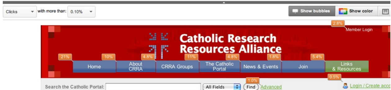
Percent of total clicks on this page from May-July 2013