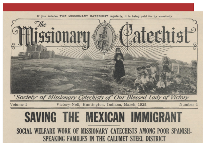
From the archives of Our Lady of Victory Missionary Sisters, Huntington, IN, March 1925.

The Catholic Newspaper Program identifies, locates, preserves and digitizes North American Catholic newspapers working systematically and collaboratively with members, scholars and associations. Find over eighty newspapers in Catholic Newspapers Online at www.catholicresearch.net