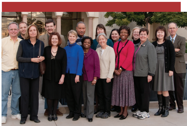
CRRA Meeting, University of San Diego, 2011

In 2008, with a mission of providing enduring global access to Catholic research resources in the Americas, eight institutions founded the CRRA. Their intent, now realized, was to lay the foundation for a collaborative and sustainable initiative through the development of a portal and a supporting membership organization. CRRA today is a nonprofit membership alliance of thirty-eight institutions committed to ensuring the Catholic tradition and views are forever visible and part of contemporary scholarship.