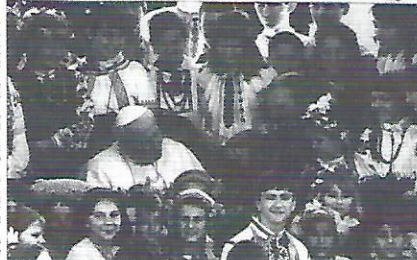
Children of Ukraine surrounded Pope John Paul II and President Leonid Kuchma at the Kiev airport upon the pope's arrival June 23.

Lviv, Ukraine — With respect for Ukraine's Orthodox majority and relatives to the nation's people who endured decades of war and repression, Pope John Paul II visited the East European nation June 23 through 27. The 81-year-old pope assured the Orthodox he did not want to steal their faithful but to overcome animosity and move forward together to transform the society. "I have not come here with the intention of proselytizing, but to bear witness to Christ together with all Christians," the pope said in his arrival speech. In his speeches and in his visits to the mass graves of the victims of the Soviets and the Nazis, the pope paid homage to the suffering of the Ukrainian people. Pope John Paul told the people "I have long awaited this visit and have prayed fervently that it might take place." Joseph Navarro Valls, the pope's spokesman, told reporters June 24 "The pope is living a dream. He has dreamed of this for many years, and now he is living it." "This man who has traveled all over the world," he said, has longed to visit the world's main Orthodox nations, and over