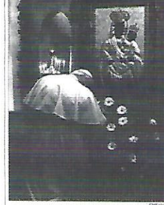
Pope John Paul II prays before an image of Our Lady of Zarvanytsia at the Church of St. Nicholas in Kiev.

KIEV, Ukraine (APNS) — The first stop on Pope John Paul II's long-awaited trip to Ukraine — a prayer visit to an icon of Mary — wasn't on the official program, but it struck a chord among Ukrainian Catholics and Orthodox alike. The pope pulled his motorcade over at the edge of a Kiev park June 23 and walked into the small Church of St. Nicholas, a former recital hall under communism, to meditate before a "miraculous" image of Our Lady of Zarvanytsia. Tradition holds that the icon was found by a Ukrainian monk fleeing persecution in the 13th century, after he fled asleep next to a stream and had a dream about Mary. He eventually built a shrine to her on the spot, and it draws thousands of pilgrims today, many seeking physical healing. "Holy Mother of God, spread your maternal mantle over all Christians," the pope murmured as he knelt before the gold-framed paint icon. He dedicated his entire visit to Mary — a point he announced at nearly every one of his stops in Ukraine.